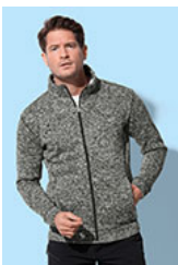
ST5850 Knit Fleece Jacket