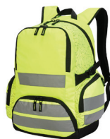
7702-43 Yellow Hi-Vis