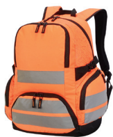
7702-33 Orange Hi-Vis